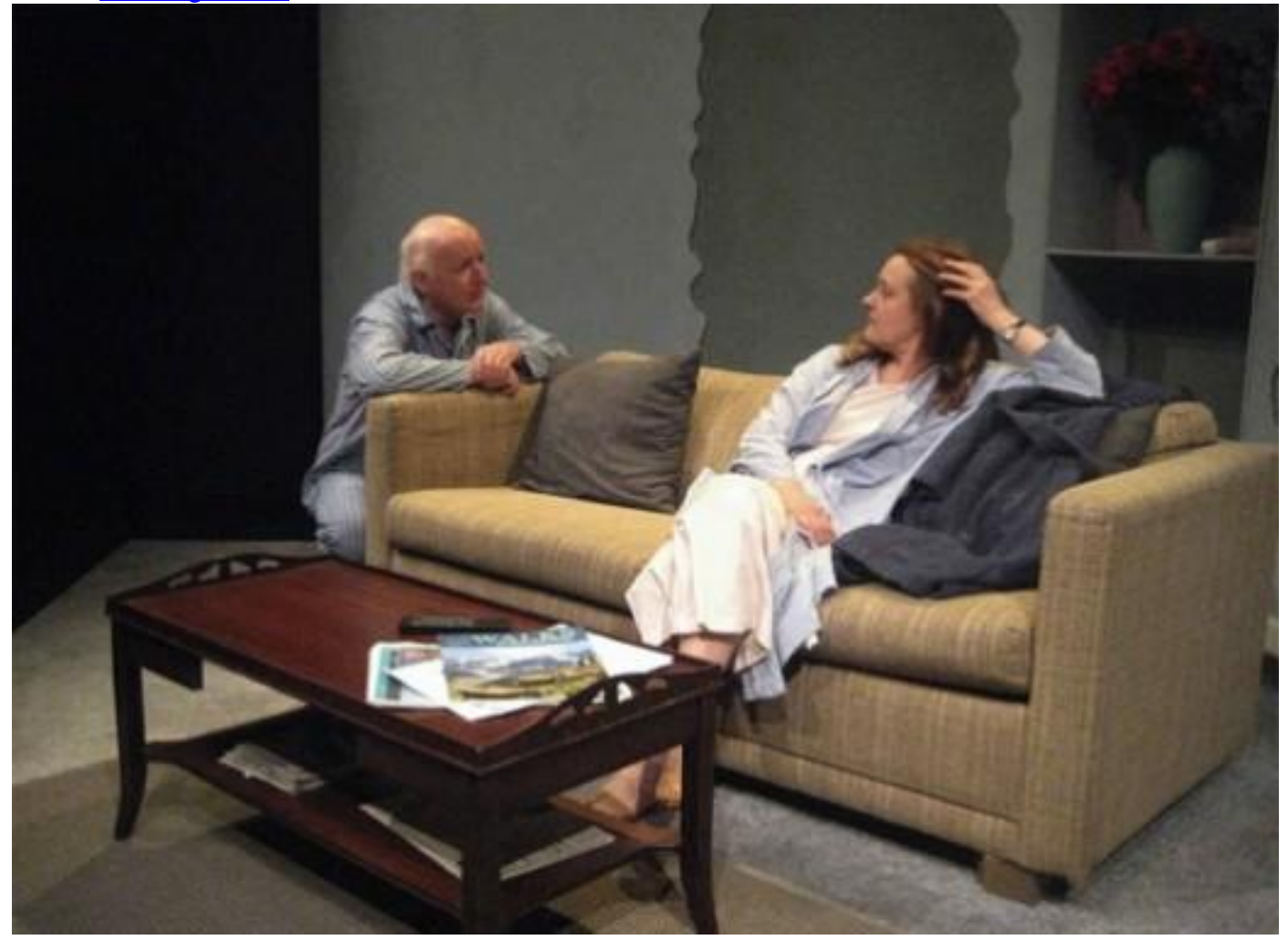
Battle of the Ages: Federer Versus Murray